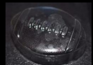
Vanilla Butter Cream