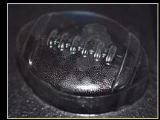
Yankee Doodle Dandy Football Candy™

We know what you're thinking; you think we forgot about the Special Teams and what they bring to Football.